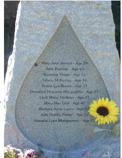
The Monument also acknowledges these women's experiences in a visual matter.

The Monument is not only a place for families who have been impacted by crime, but also for others who work toward change.